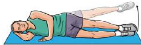
Side-lying leg lift