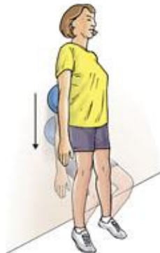
Wall squat with a ball