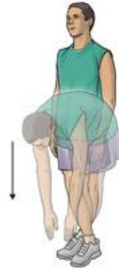
Iliotibial band stretch (standing)