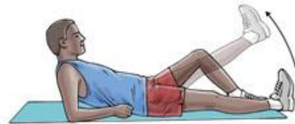
Straight leg raise